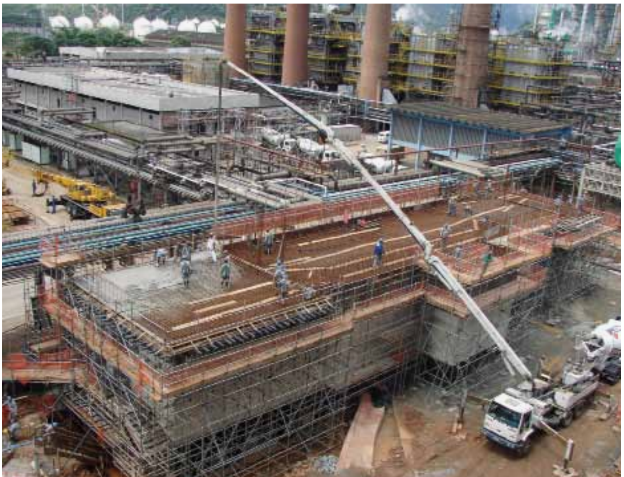
Presidente Bernardes de Cubatão Refinery, Brazil.